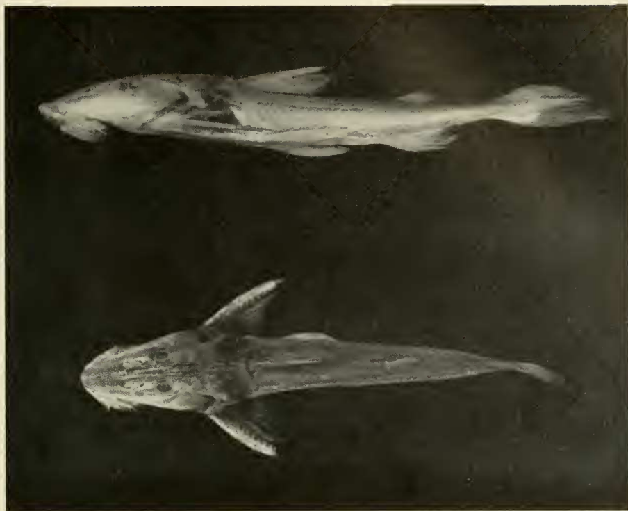
FIGURE 1. Leptodoras myersi : Holotype, 74.6 mm. standard length, ANSP 112318.

present. Head covered by small, elongate, pale fleshy ridges, arranged in a pattern (see fig. 1).